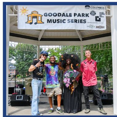
AUSTIN & THE SYD EXPERIENCE